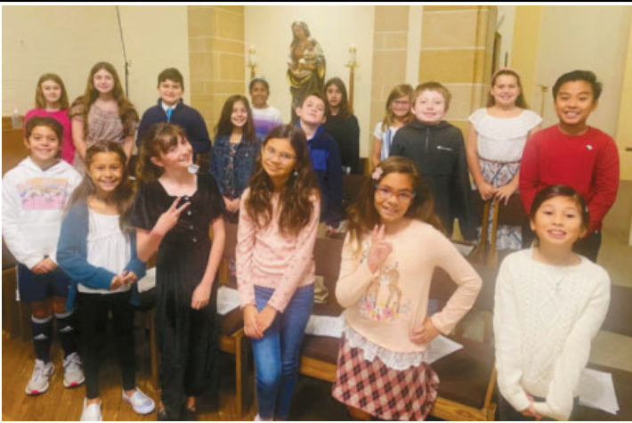
The beautiful voices of the Children's Choir, pictured after the 9:00 am Mass on Sunday, October 2.