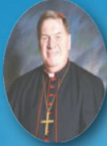
Pilgrimage led by Cardinal Joseph W. Tobin, C.Ss.R.

The Holy Rosary Procession of Parish Banners Holy Mass in the Great Upper Church