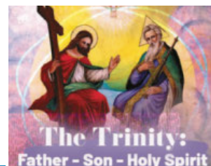
The Trinity: Father - Son - Holy Spirit