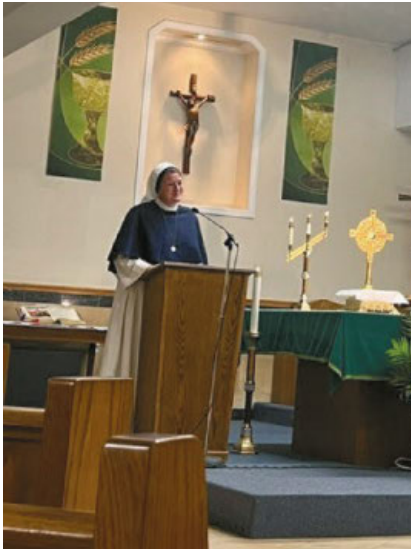
Mass, Eucharistic Adoration, Confession, and Guest Speaker held at the Parish Retreat House.

A Day Of Reflection Presented by The Society Of St. Lydia