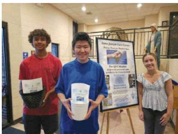
Youth Group Members Collecting at the Harrison Street Entrance