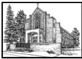
Oradell/New Milford, NJ