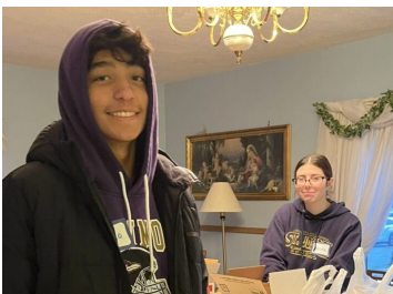
Confirmation candidates pitched in!